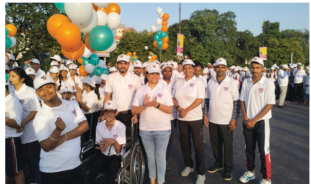
Inclusive and Participative Mega Walkathon-Voters Awareness Rally