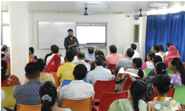
Awareness session for parents - Know your rights