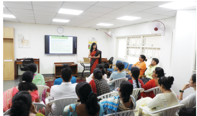
Mind-Prevention, Preparation & Management