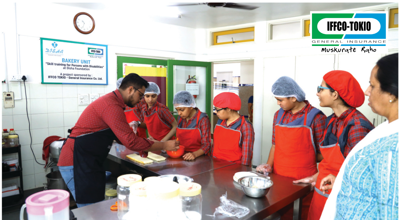
IFFCO Tokio General Insurance facilitated the establishment of Vocational Training Unit