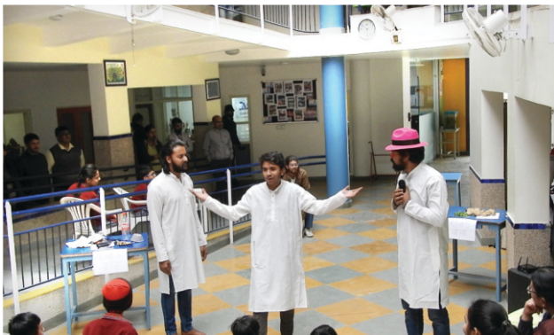
Comedy Act by Rangmastanney Group