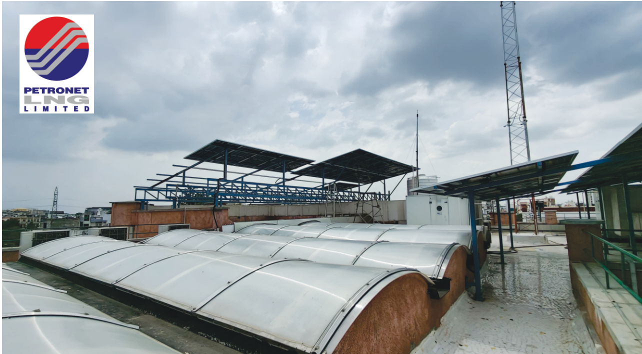
Petronet LNG Ltd. facilitated the installation of solar panels, enhancing our sustainability efforts.