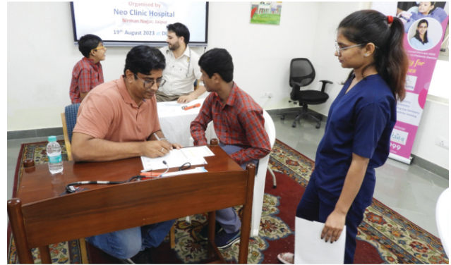
Health Check-up Camp