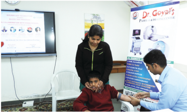
Blood Group Identification Camp

TO PROMOTE, PROTECT AND DEFEND THE HUMAN RIGHTS OF SPECIAL NEED PERSONS