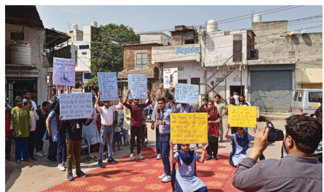
CBR programme at Jawahar Nagar Kaachi Basti