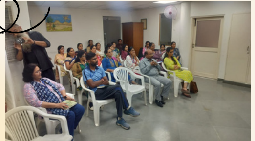
Directing team and Disha staff revealing