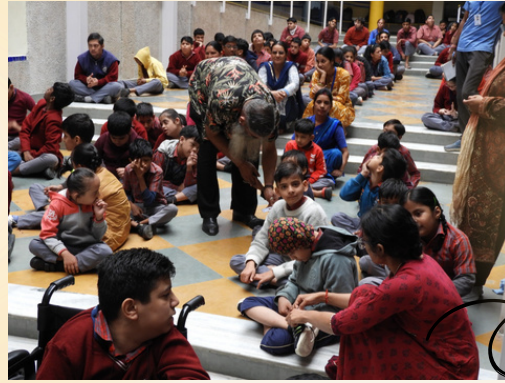
Discussing story & Assigning roles