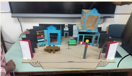
model of set for the stage show